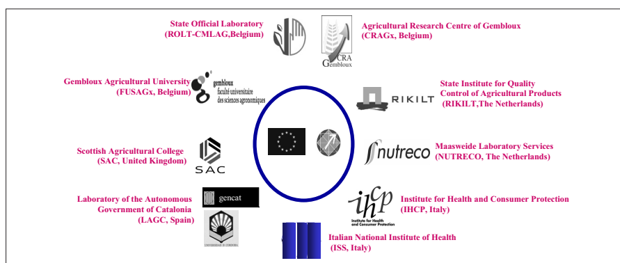
Figure 1. The STRATFEED consortium.

The classical microscopic method is currently the only official method for the detection of MBM in feedstuffs accepted throughout Europe. 1 This method is based on the microscopic identification and estimation of sieved and decanted fractions of particles (mainly bones) of animal origin in feedstuffs. Since the examination is visual, the results depend on the analyst's knowledge of various features of the ingredients and