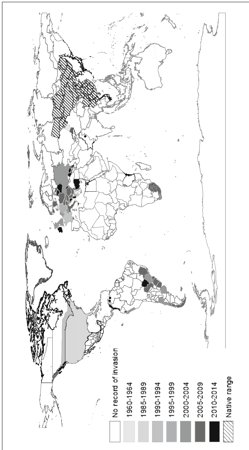
Fig. 1 Global distribution of H. axyridis