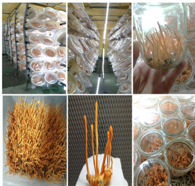
Figure 1. Cordyceps militaris fruiting body cultivation—Shanghai.

The analysis of the data obtained shows that in IM1 medium, the amount of fresh fruit body obtained represents 35% relative to the feedstock, the mycelial culture represents 92.5% relative to the feedstock, and the total amount of feedstock for the production of extracts represents 127.5% relative to the feedstock.